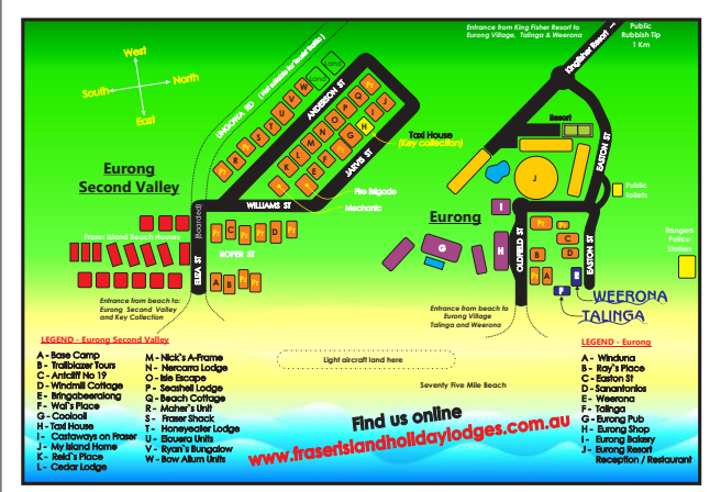
The above stylistic map of Eurong shows the actual residential buildings in Eurong Village

Street Names: Many of the first people to build on their blocks in Eurong have been honoured by having the Maryborough City Council name streets after them, Oldfield, Easton Williams, Anderson, Buffey, Roper and Jarvis. The name Sinclair was conspicuously omitted.